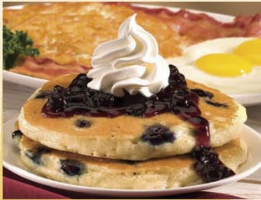
Pancake Combo (pictured with Double Blueberry Pancakes)

Jarabe sin azúcar disponible a su petición.