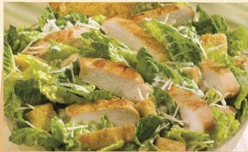
Grilled Chicken Caesar Salad