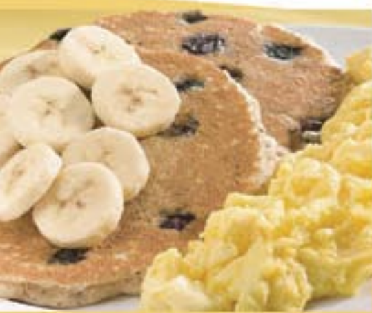
Blueberry Harvest Grain 'N Nut ® Combo For Me

Calories / Carbohydrates / Fat / Saturated Fat / Protein / Sodium Calorías / Carbohidratos / Grasa / Grasa Saturada / Proteína / Sodio