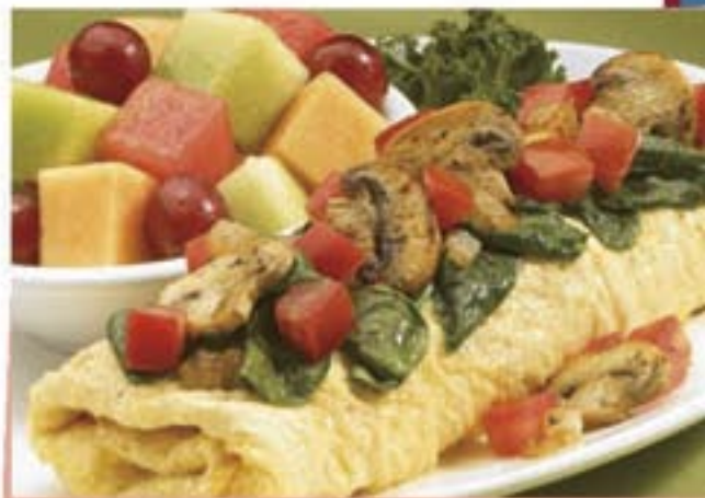
Spinach, Mushroom & Tomato Omelette For Me

Con Verduras For Me 360 / 34g / 14g / 2.5g / 25g / 700mg