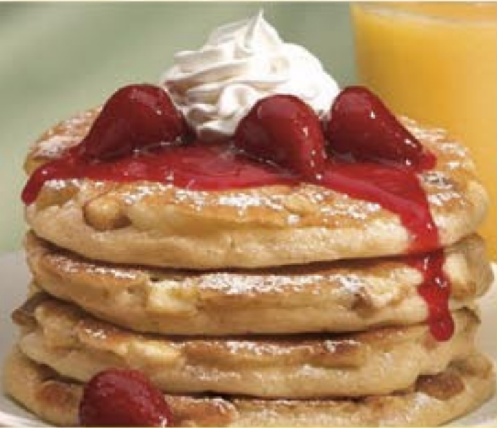
New York Cheesecake Pancakes

Sugar-free syrup available upon request.