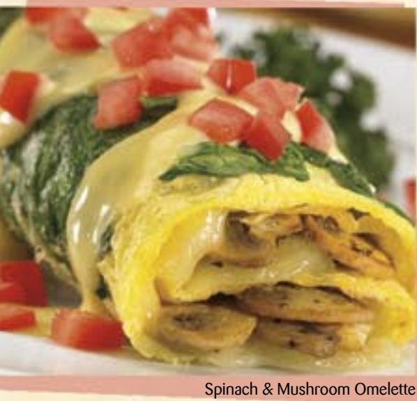
Spinach & Mushroom Omelette

Omelette de Espinacas y Champiñones con Queso Suizo