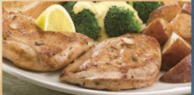
Mediterranean Lemon Chicken