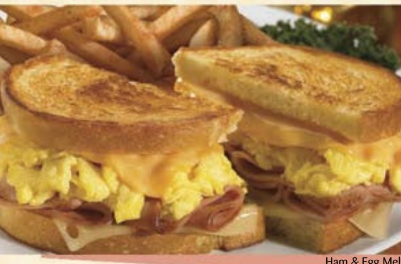
Ham & Egg Melt

Sándwich de Huevo, Jamón y Queso Derretido