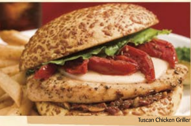
Tuscan Chicken Griller