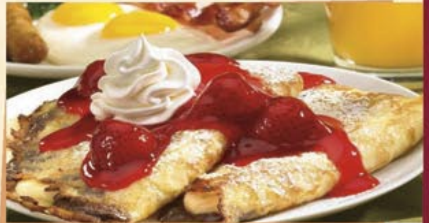
International Crepe Passport (pictured with Nutella® crepes)