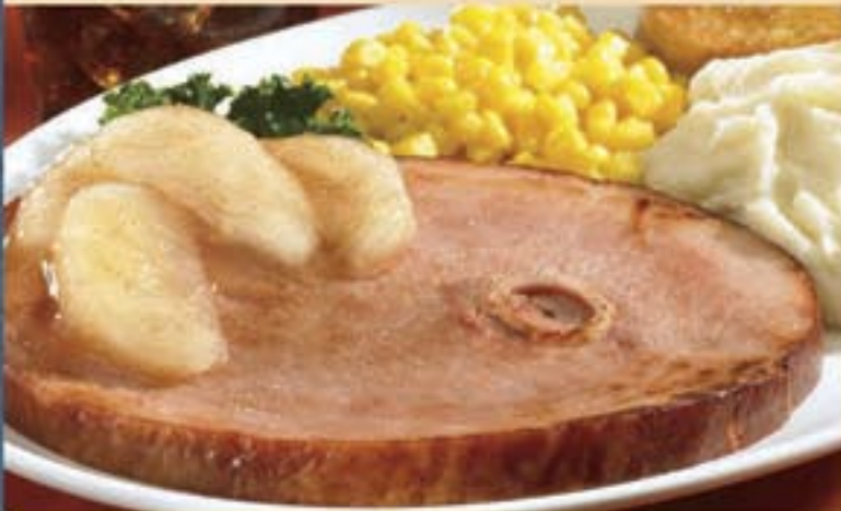
Thick-Cut Bone-In Ham Dinner