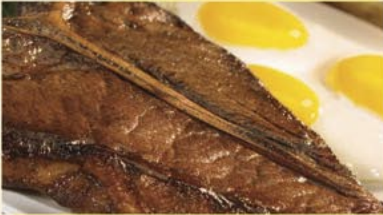
T-Bone Steak & Eggs