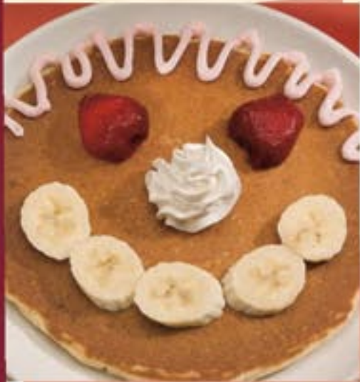
Create-A-Face Pancake For Me (shown decorated)

Sorry, no coupons or discounts on kids' items.