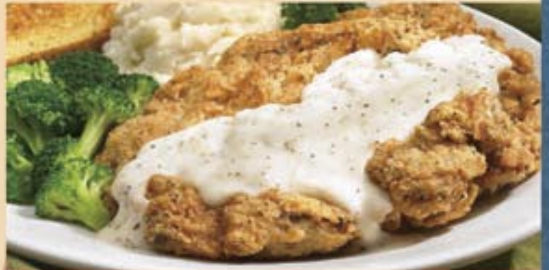
"Big" Chicken Fried Steak