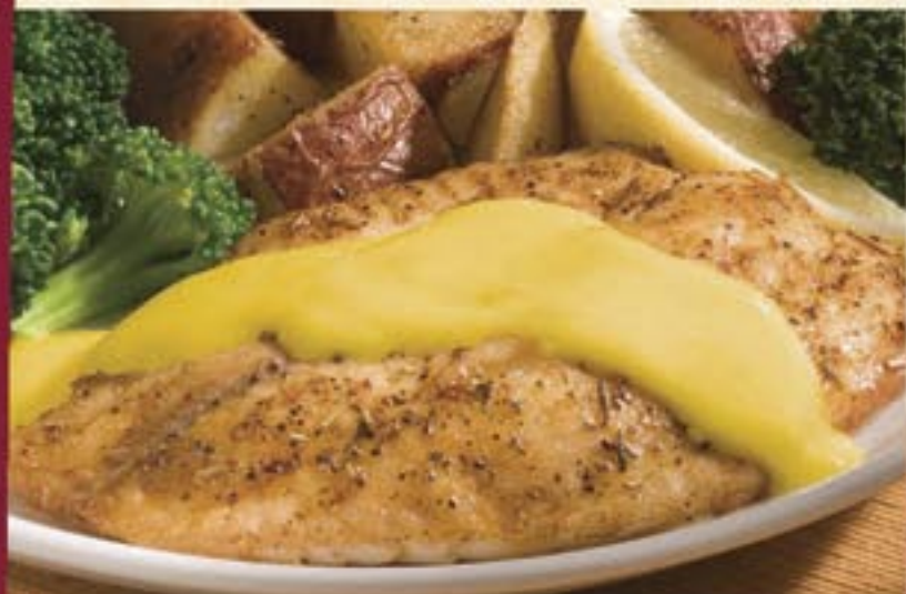
Senior Grilled Tilapia Hollandaise

Add soup or a small house salad for only 1.59