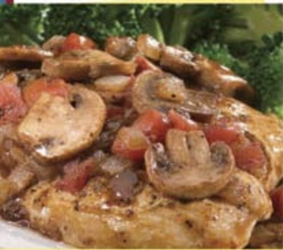
Balsamic-Glazed Chicken For Me