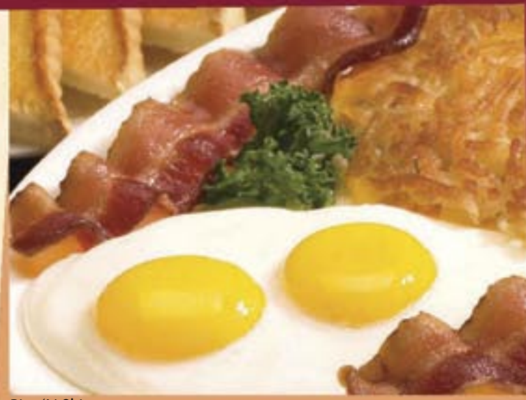
Rise 'N Shine