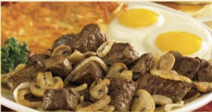
Sirloin Tips & Eggs