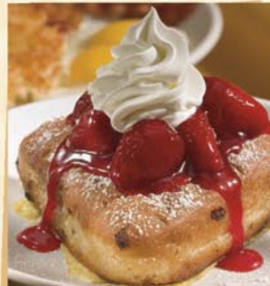
Stuffed French Toast Combo

*NOTICE: ITEMS MARKED WITH AN * MAY BE COOKED TO ORDER. CONSUMING RAW OR UNDERCOOKED MEAT OR EGGS MAY INCREASE YOUR RISK OF FOODBORNE ILLNESS.