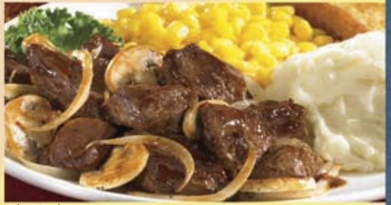
Sirloin Steak Tips Dinner