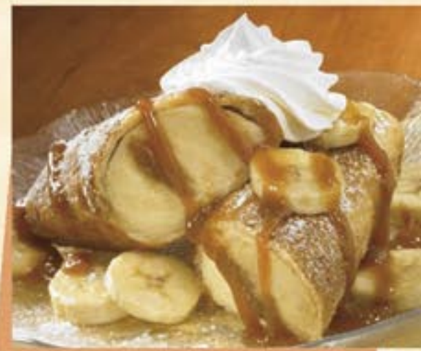
Crispy Banana Caramel Cheesecake