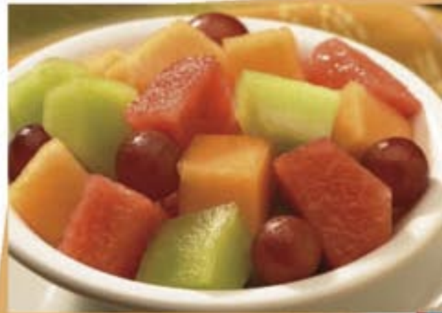
Fresh Fruit Bowl For Me

Plato de Fruta Fresca For Me 110 / 23g / 0g / 0g / 3g / 10mg