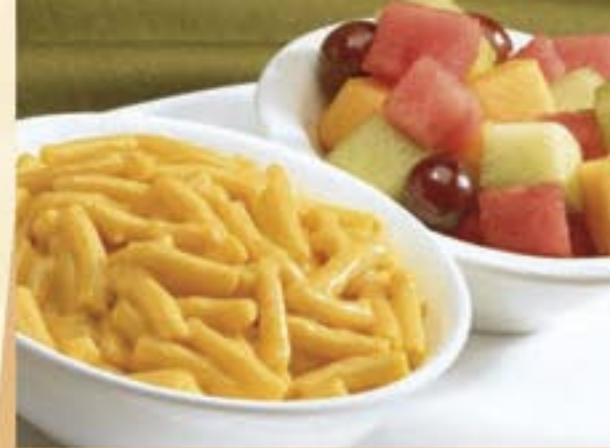
Kraft® Macaroni & Cheese