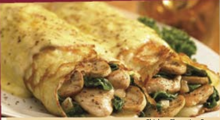
Chicken Florentine Crepes