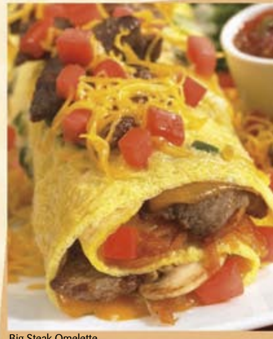
Big Steak Omelette