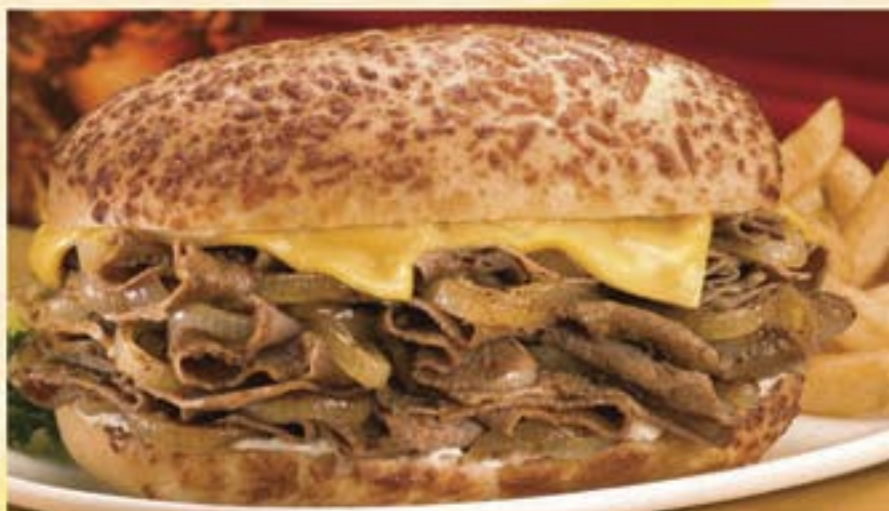
Philly Cheese Steak Super Stacker